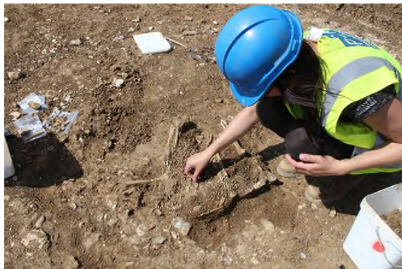
Excavation of a human burial

Find out about the development of the Roman road, the origins of the settlement and its eventual abandonment in the late 4th/5th century. Is there evidence for early Saxon settlement on the site?