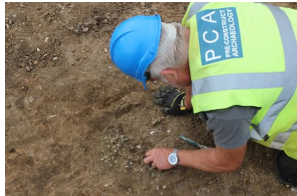
Excavation of Roman finds

Site location, please access via Hildersham Lane, parking available in field (no access from Linton Road, parking in field at owners own risk)